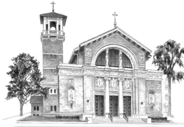
St. Joseph Church 1847