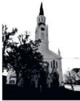
Holy Trinity Church 1861

We are currently in need of the following items for those we serve: