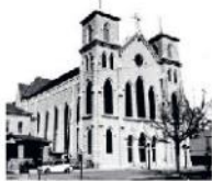
Emmanuel Church 1837