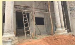
Thanks to your generosity the plastering of the walls of the new church in Nkanchi village has begun!